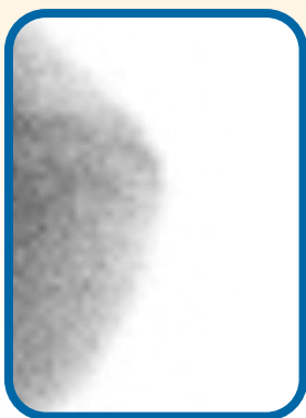
BSGI, confirmed by biopsy, shows that no cancer is present.