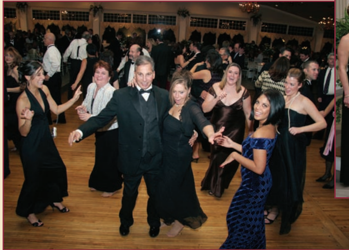
Guests dance the night away as they celebrate the Auxiliary's successful Ball. The event raised over $80,000.