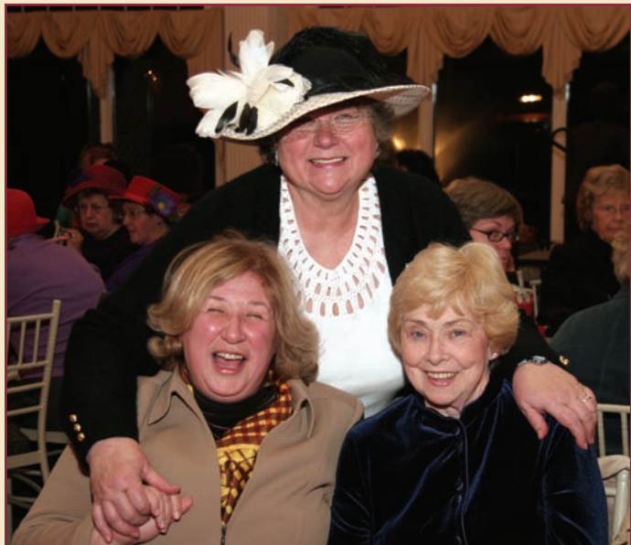
The Auxiliary's fashion show raised over $5,000 for programs at the Bradley Memorial campus.