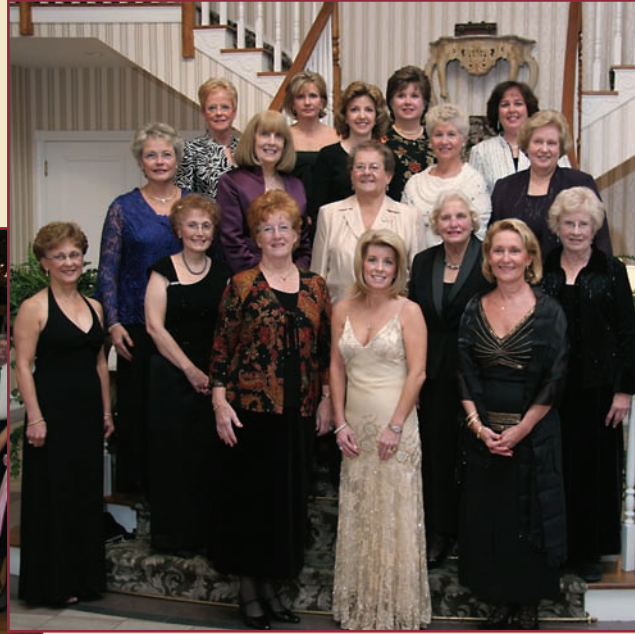
The Chrysanthemum Ball Committee